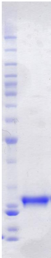
Coomassie blue-stained SDS-PAGE (4-12% acrylamide) of 4 \mu\text{g} of RBC CHD1-[CHR] (His). MW markers (left) are, from top, 220, 160, 120, 100, 90, 80, 70, 60, 50, 40, 30, 25, 20, 15, 10 kDa.

STORAGE: -70°C. Thaw quickly and store on ice before use. The remaining, unused, undiluted protein should be snap frozen, for example in a dry ice/ethanol bath or liquid nitrogen. Minimize freeze/thaws if possible, but very low volume aliquots (<5 \mu\text{l} ) or storage of diluted enzyme is not recommended.